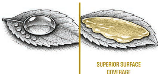
SUPERIOR SURFACE COVERAGE

A superior, environmentally conscious nonionic surfactant (NIS) that ensures the product flattens and adheres to the leaf surface immediately upon contact.